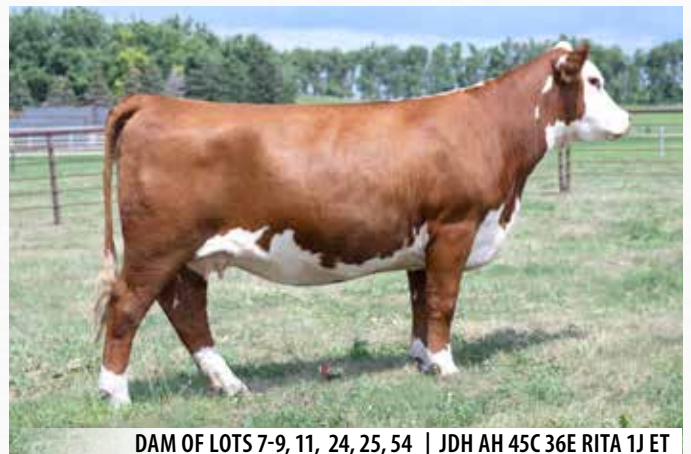
DAM OF LOTS 7-9, 11, 24, 25, 54 | JDH AH 45C 36E RITA 1J ET