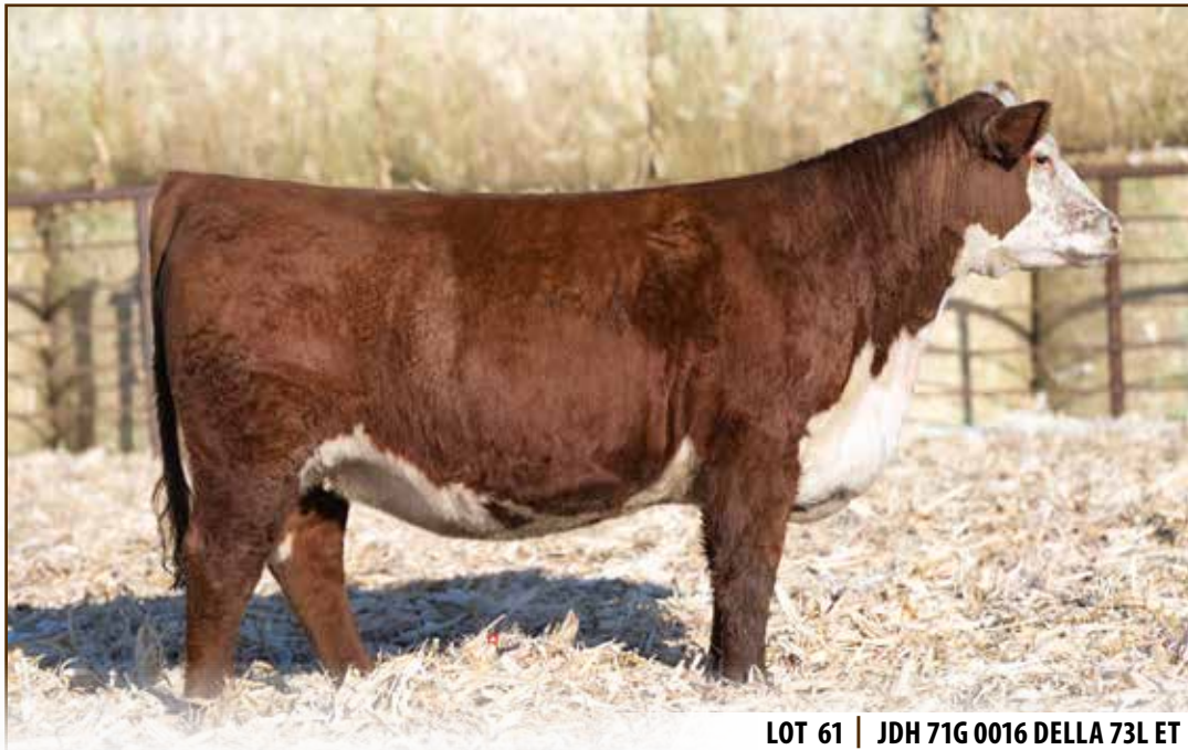
LOT 61 | JDH 71G 0016 DELLA 73L ET