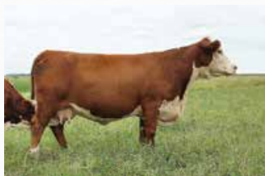
DAM OF LOT 36

We are retaining a ¼ revenue sharing semen interest, selling full possession.