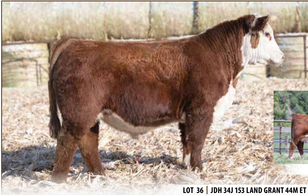
DAM OF LOT 36