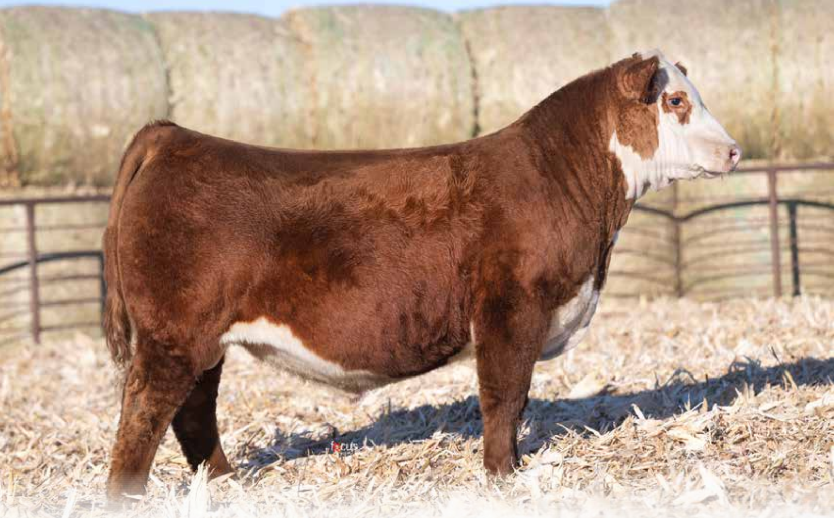
LOT 33 | JDH ND 789 LAND GRANT 54M ET