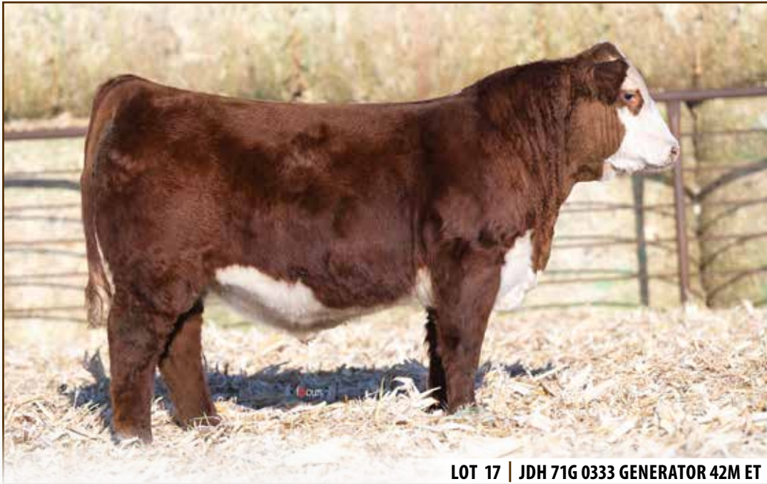
LOT 17 | JDH 71G 0333 GENERATOR 42M ET