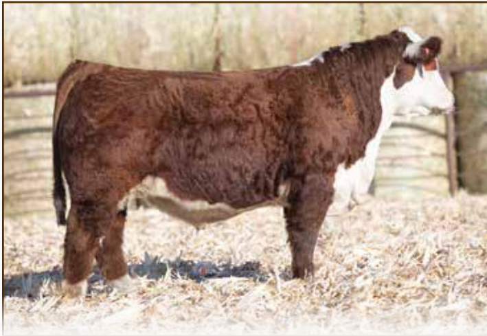
LOT 47 | AH MMC LUCKY PRINT 4388 ET