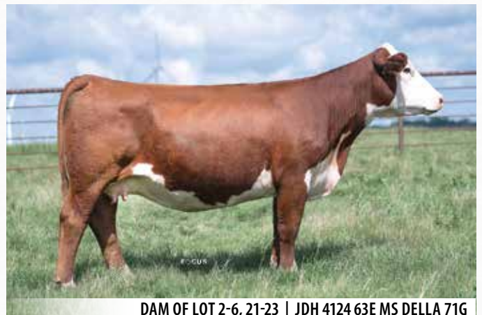
DAM OF LOT 2-6, 21-23 | JDH 4124 63E MS DELLA 71G

Retaining 1/4 revenue sharing semen interest.