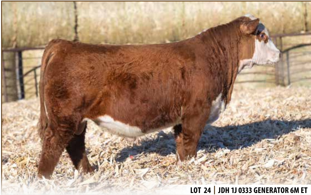
LOT 24 | JDH 1J 0333 GENERATOR 6M ET