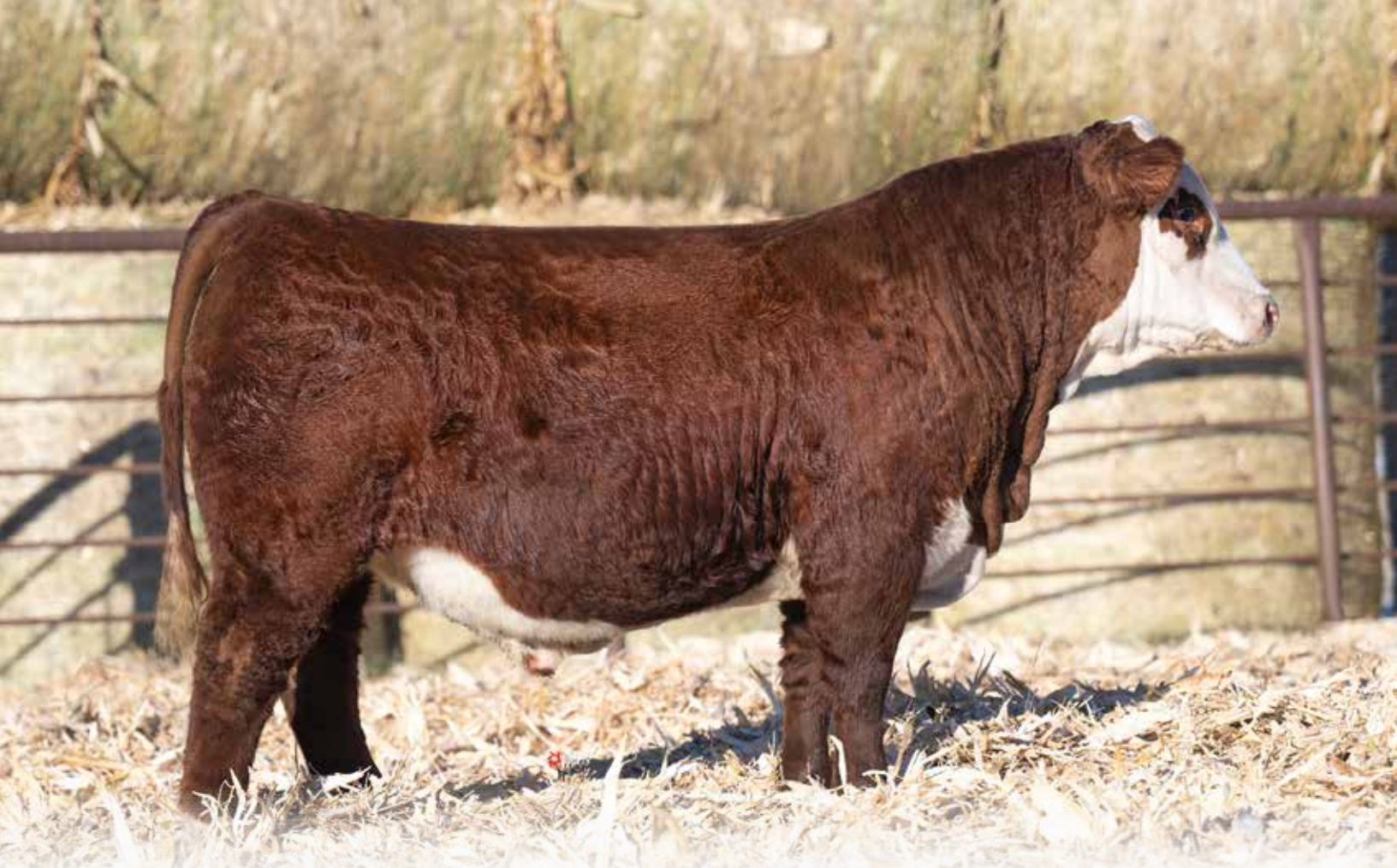
LOT 12 | JDH 73F RED CLOUD 23M ET