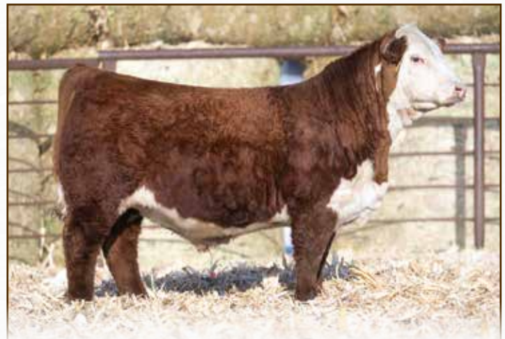
LOT 15 | JDH 121G RED CLOUD 62M ET

The last Red Cloud in the offering and he might be the best. Square built, big stified with a bold rib cage and a huge top. We have gone back and forth about keeping and using this bull ourselves and we still might decide to before sale day. 7 traits in the top 10% of the breed.