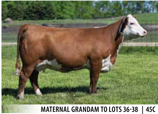
MATERNAL GRANDAM TO LOTS 36-38 | 45C