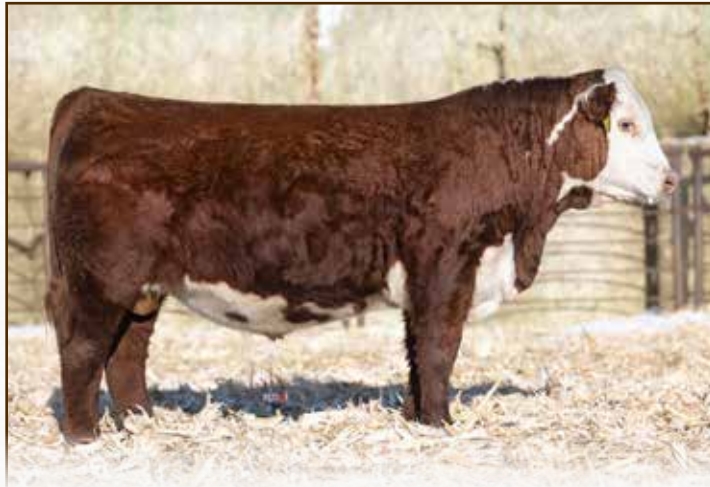
LOT 22 | JDH AH 8032 GENERATOR 41M ET

If you want to add pigment and love goggle eyes take a look here. Another big volume son of Generator out of the dam of Final Print with a great set of EPD's. 10 traits in the top 10% of the breed.