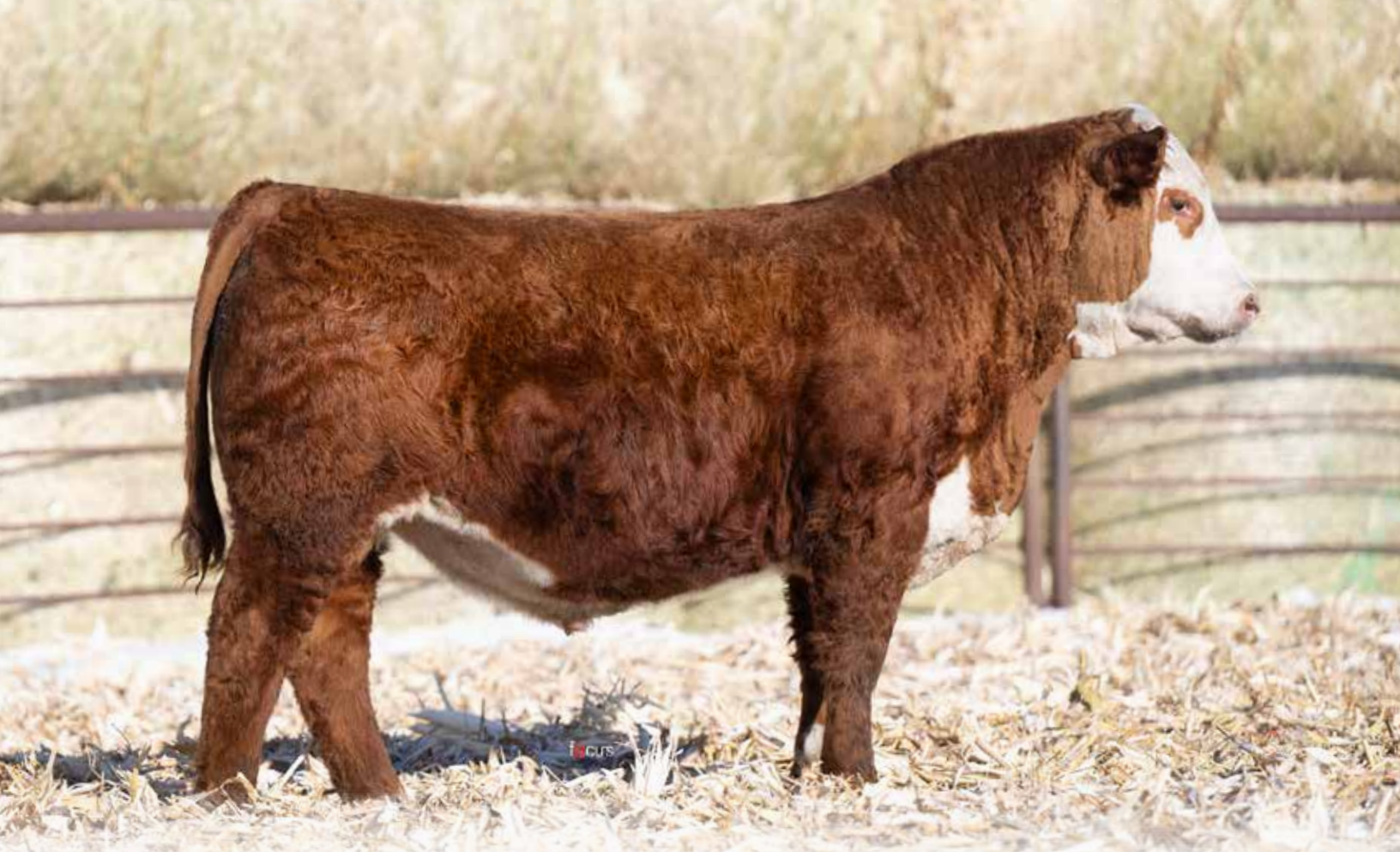
LOT 26 | JDH ND 610D GENERATOR 85M ET