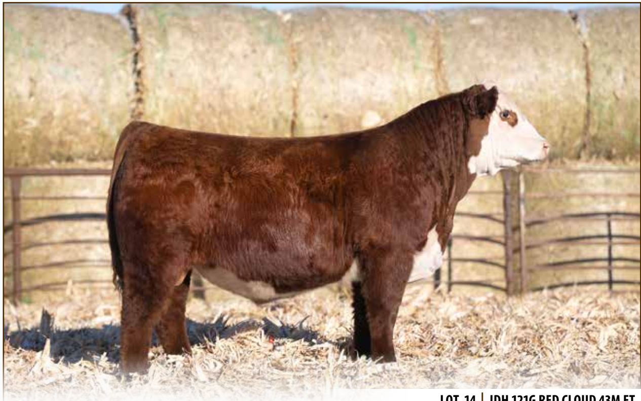
LOT 14 | JDH 121G RED CLOUD 43M ET