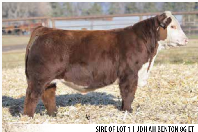
SIRE OF LOT 1 | JDH AH BENTON 8G ET