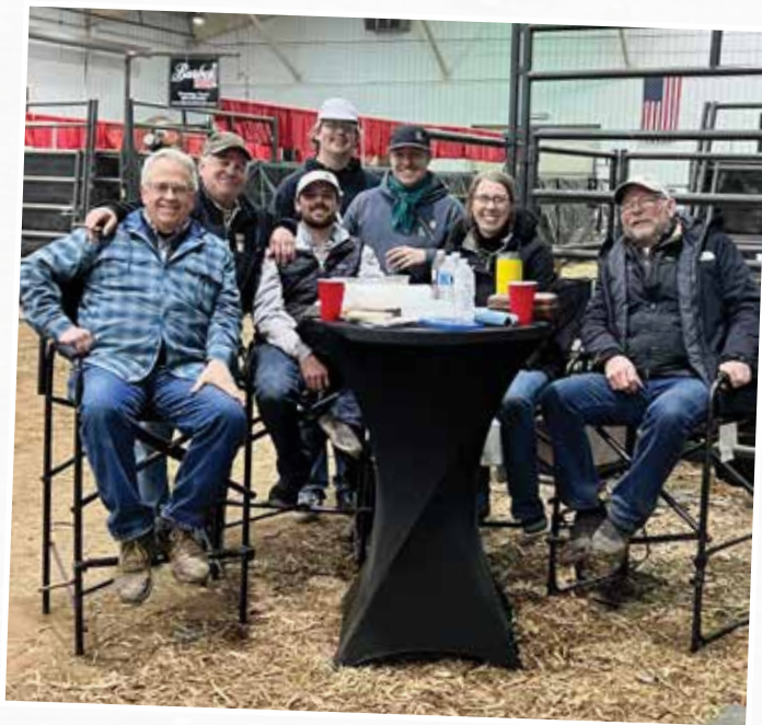
This full sister to Lot 41 is headed to Denver with the great crew pictured to the right.