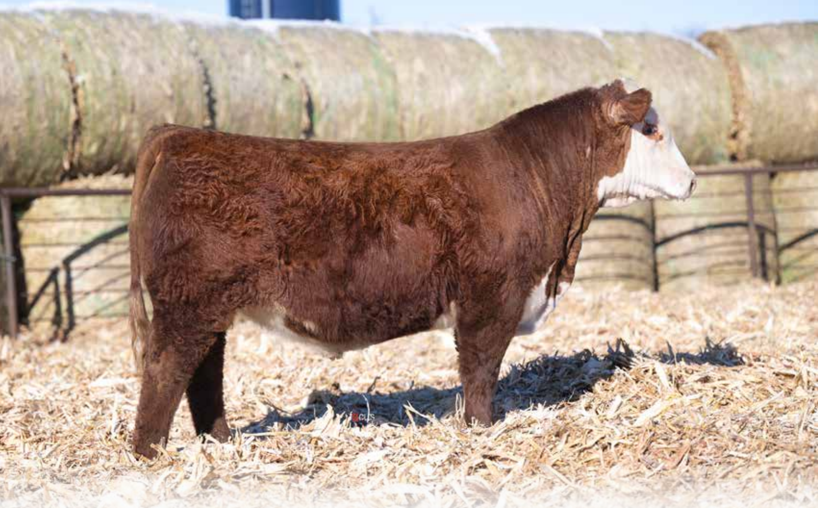
LOT 41 | JDH 73F 619K ON DEMAND 123M ET