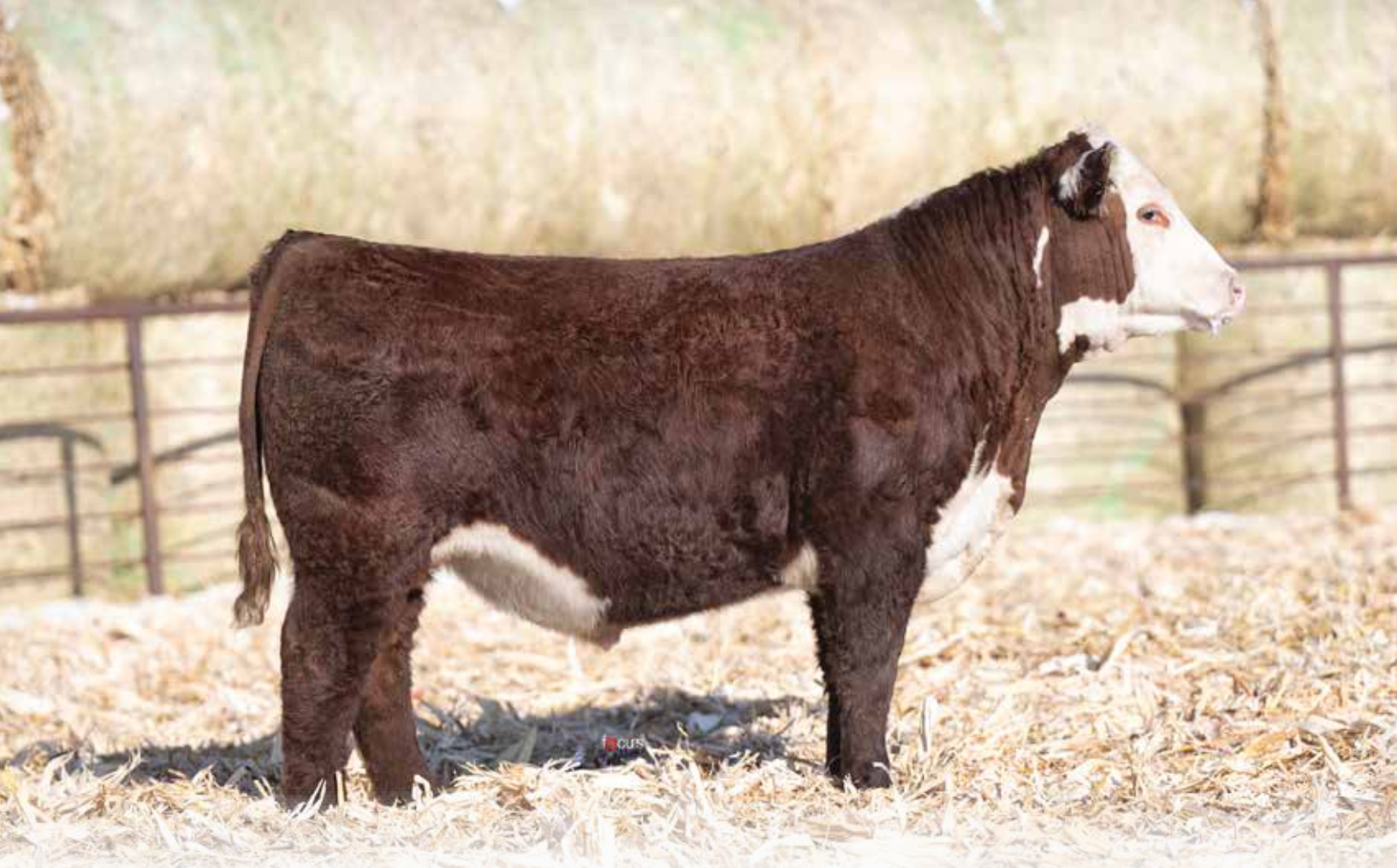
LOT 2 | JDH AH 8032 RED CLOUD 55M ET