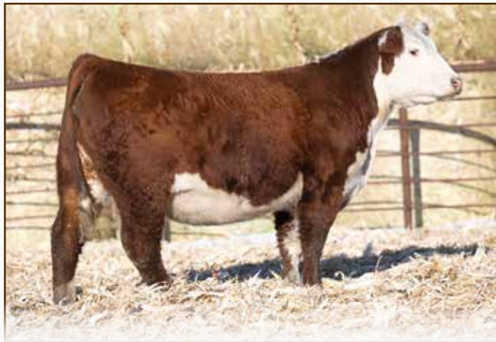
LOT 66 | JDH 66G 9365 MISS ENTICE 80L

Pasture Exposed to 4B Garfield 338 from 5-19 to 8-1. Vet called safe for a February 25th calving date.