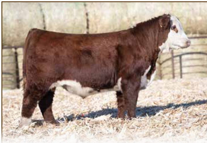
LOT 54 | JDH 1J K384 KIOSK 142M

High performance bull loaded with muscle and big topped. This bull will certainly compliment a set of black cows. Best numbered of the full brothers with 7 traits in the top 10% of the breed.