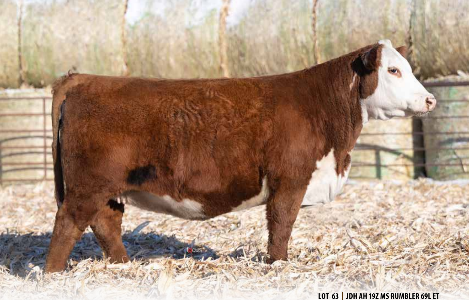
LOT 63 | JDH AH 19Z MS RUMBLER 69L ET