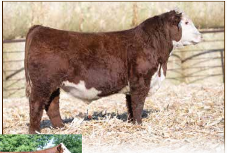
LOT 29 | AH SMAK GENERATOR 4288 ET

Nice patterned Generator out of the full sister to 45C. His maternal traits are outstanding with his SCF, Udder and BMI all in the top 1% of the breed. He should leave you great daughters.