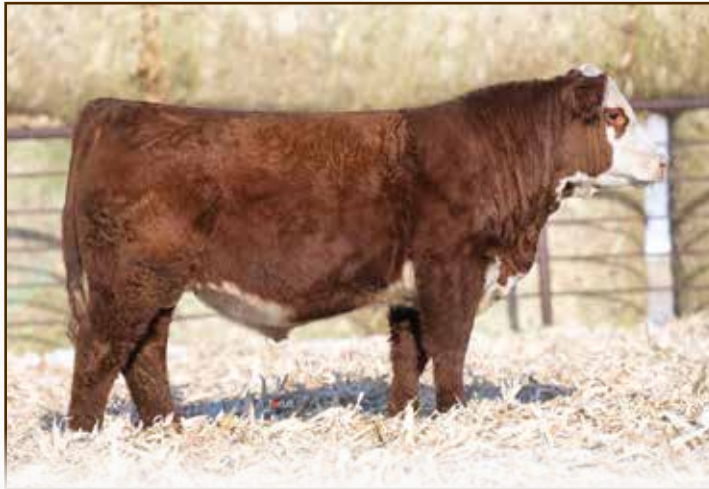
LOT 42 | JDH ND 789 ON DEMAND 124M ET