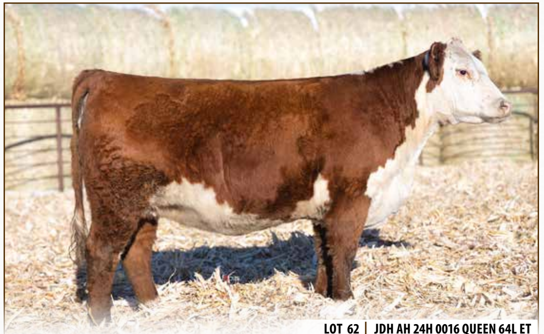
LOT 62 | JDH AH 24H 0016 QUEEN 64L ET

Pasture Exposed to 4B Garfield 338 from 5-19 to 8-1. Vet called safe for a February 26th calving date.