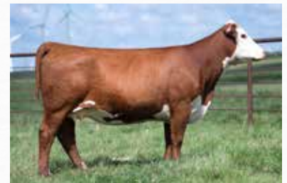
JDH AH 45C MS MIGHTY 121G ET

Retaining 1/4 revenue sharing semen interest.