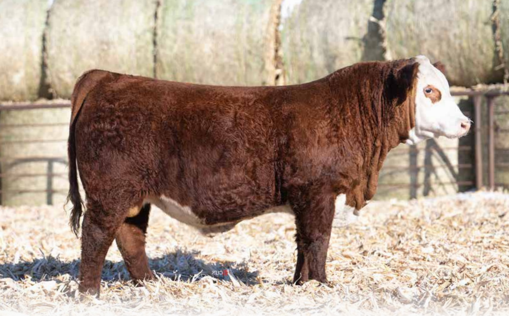
LOT 13 | JDH 73F RED CLOUD 32M ET