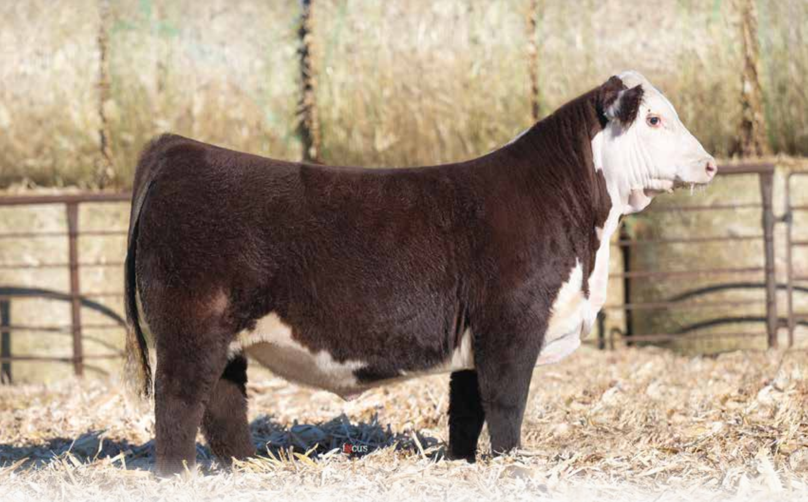
LOT 1 | JDH 97J 8G BENTON 65M