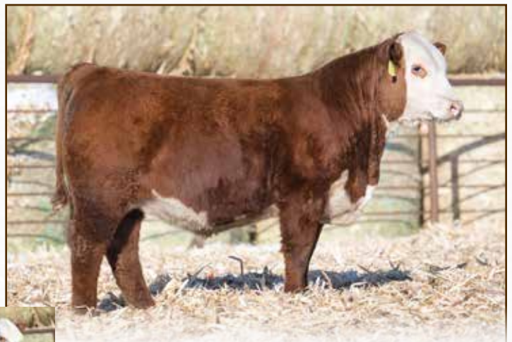
LOT 32 | JDH 19H 0333 GENERATOR 94M

The Dam of 94M brings in a high end bull prospect every year and this guy is no different, he posses all the traits of a productive herd bull. Plus, this red eyed rascal offers the added bonus of being huge bodied, heavy muscled and great numbered. 6 traits in the top 5% of the breed including a 175 CHB.