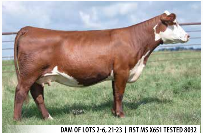
DAM OF LOTS 2-6, 21-23 | RST MS X651 TESTED 8032