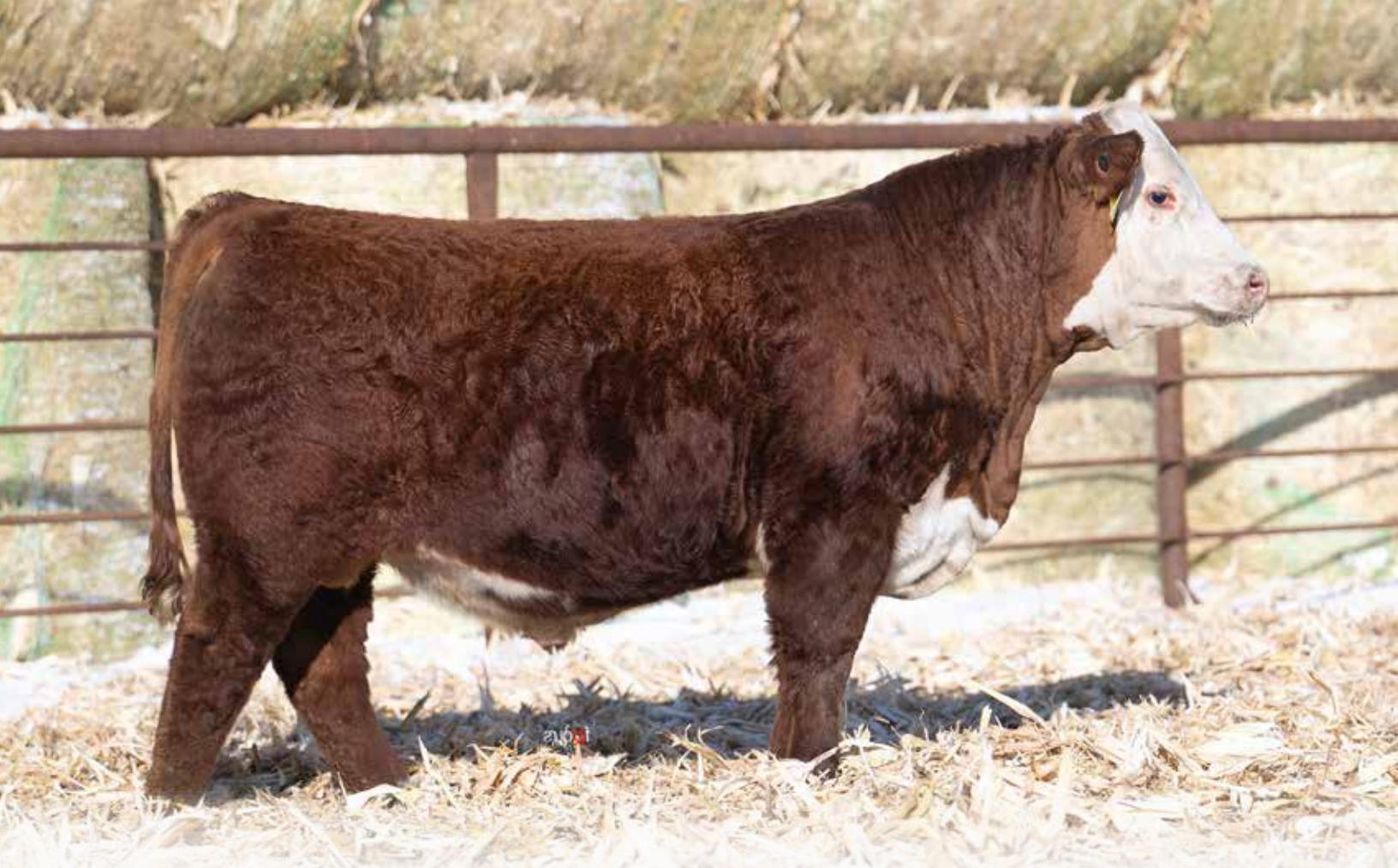
LOT 5 | JDH AH 8032 RED CLOUD 40M ET