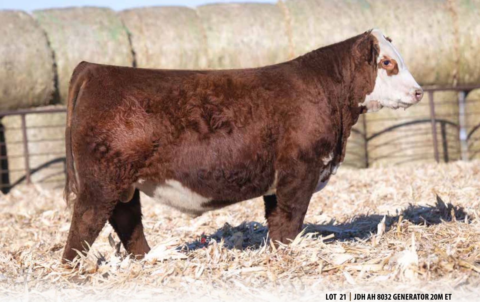
LOT 21 | JDH AH 8032 GENERATOR 20M ET