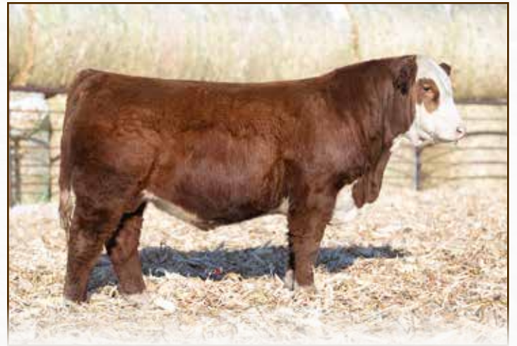
LOT 57 | JDH 81J K379 KIRBY 36M

Rugged, powerfully constructed, growthy kind of a bull. We have loved this bruiser since day one, but unfortunately he came back a DBC. He will look outstanding on a set of commercial cows.