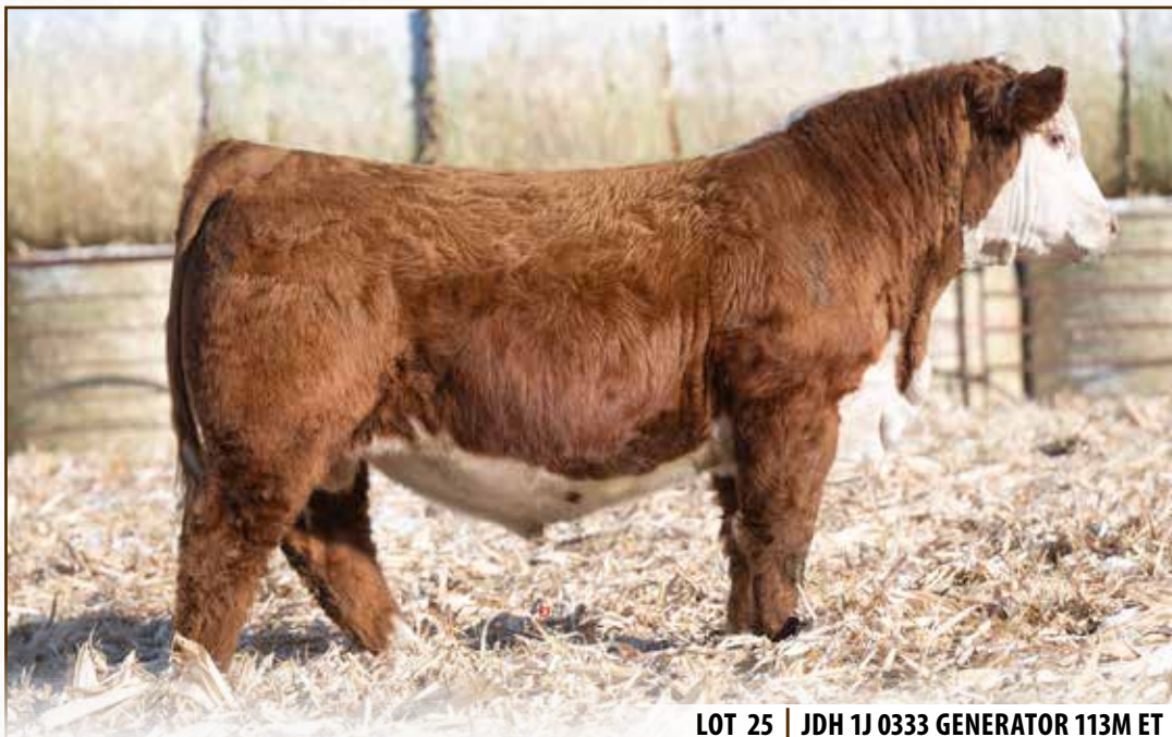
LOT 25 | JDH 1J 0333 GENERATOR 113M ET

Here is one with added style. These Generator progeny are all stamped with extra pigment and look. This bull will sire heavy, good looking calves and has the progressive numbers we all look for in a herd bull. 10 traits in the top 10% of the breed.