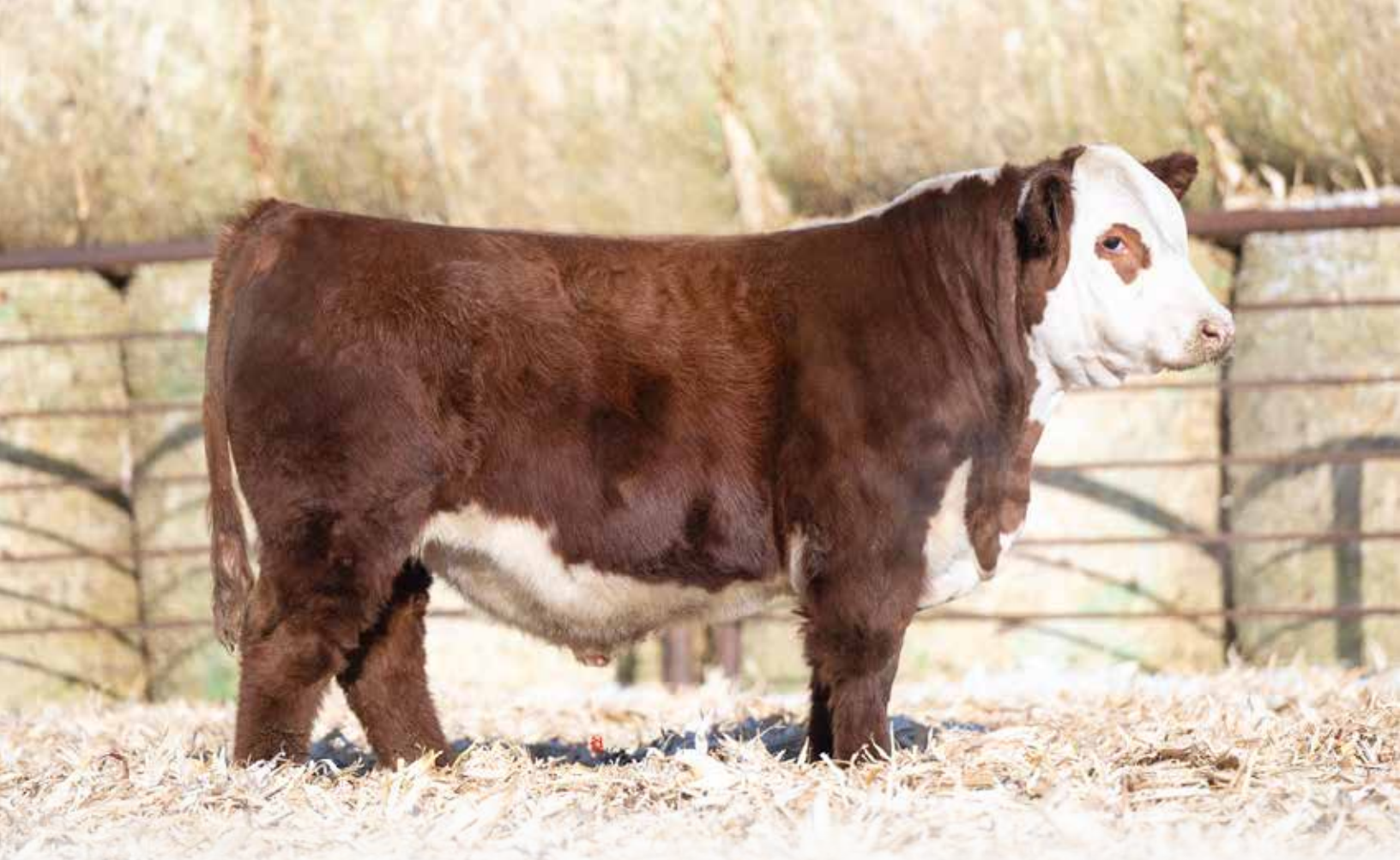
LOT 39 | AH MMC 19Z ARLO 4978 ET