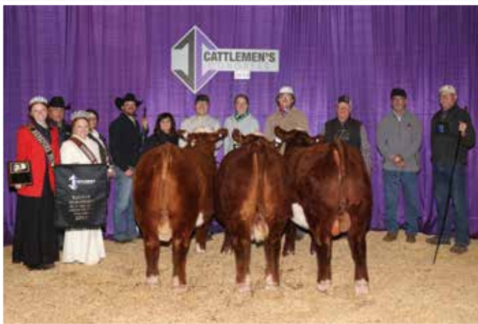
RES. CHAMPION PEN OF THREE BULLS 2024 CATTLEMEN'S CONGRESS