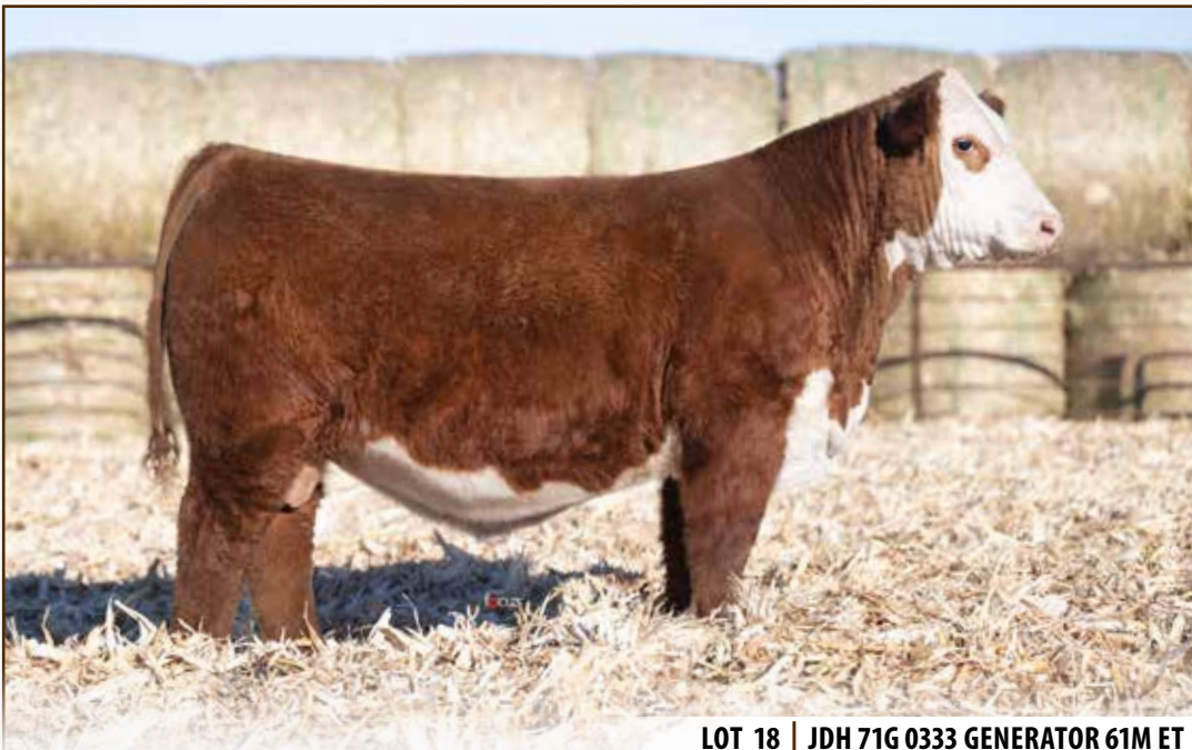
LOT 18 | JDH 71G 0333 GENERATOR 61M ET

The biggest framed bull of the flush. 61M offers outstanding performance on foot and on paper. He's huge topped, big stifted with loads of body and mass.