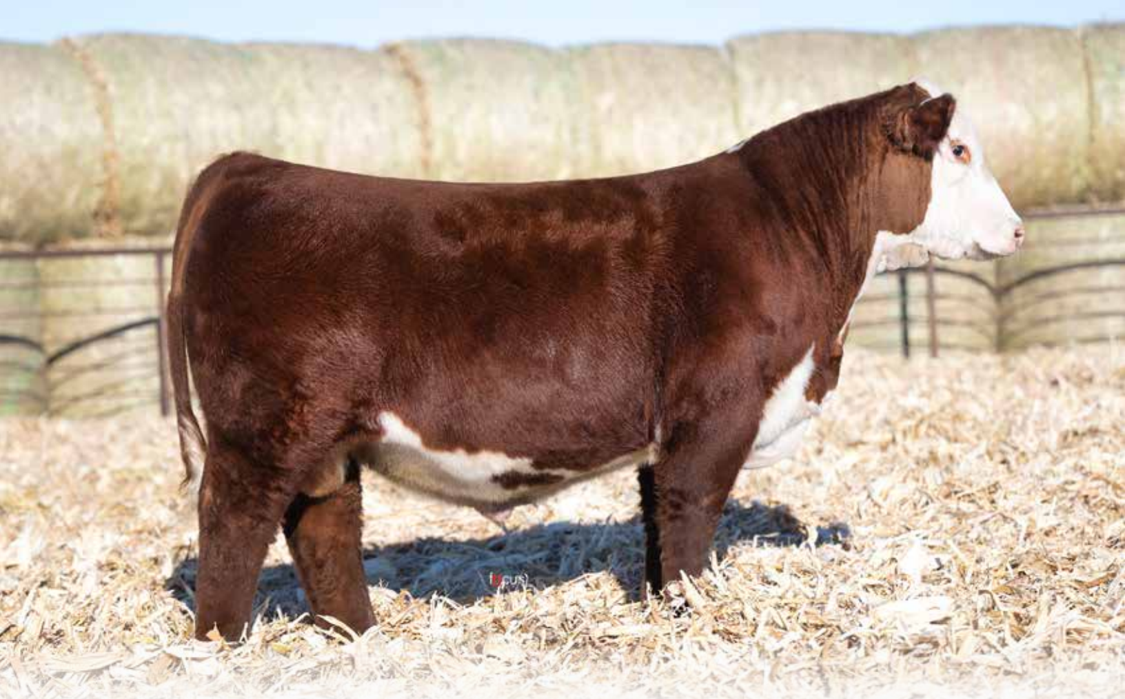
LOT 16 | JDH 71G 0333 GENERATOR 7M ET