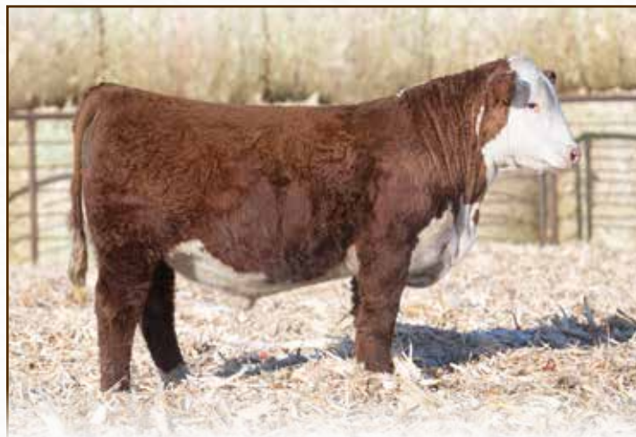
LOT 8 | JDH 1J 376H RED CLOUD 10M ET

Here is maybe the most complete 1J son we will offer. This bull is balanced with added eye appeal and look. He is great numbered and backed by one of our top young donors, 1J. This bull will have updated genomics come sale day.