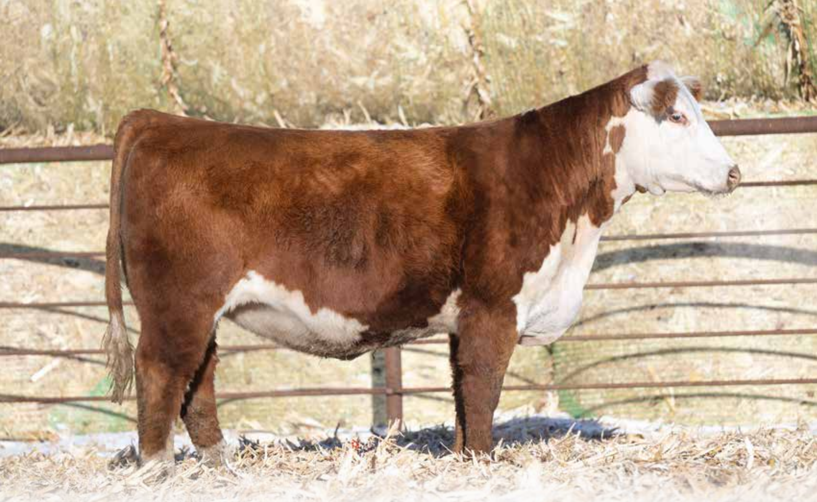
LOT 60 | AH JDH MMC MEXICO LADY 194L ET