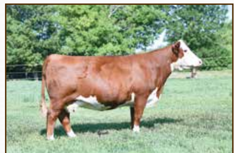
DAM OF LOT 46 | JDH AH MS 34X VICTOR 33Z14C ET