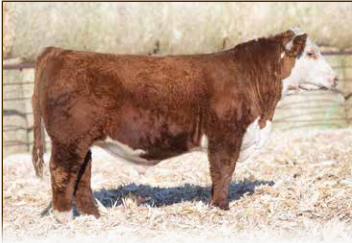
LOT 53 | JDH MD 19J DESPERADO 30M ET

Homozygous Polled. Big framed bull with muscle and power. Offers great SCF and BMI scores.