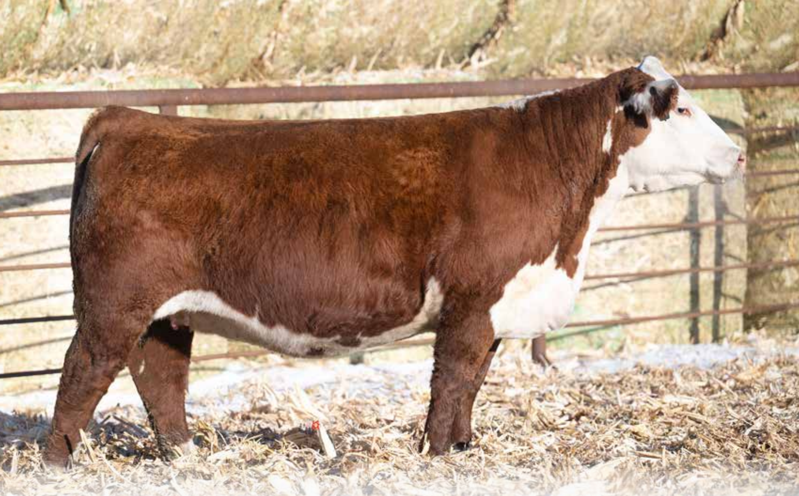
LOT 73 | JDH MD 17G MS HOUSTON 20L ET