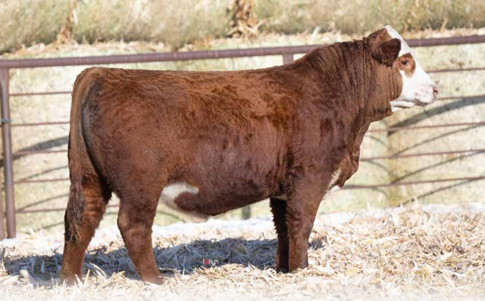
LOT 3 | JDH AH 8032 RED CLOUD 13M ET