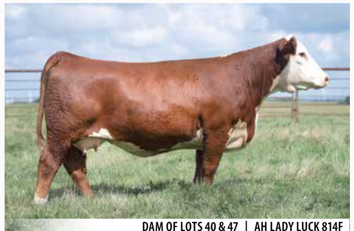
DAM OF LOTS 40 & 47 | AH LADY LUCK 814F

We are retaining a 1/4 revenue sharing semen interest, selling full possession.