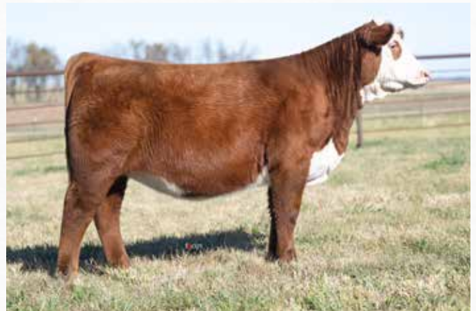
FULL SISTER TO LOT 12 | 84M

84M is heading to Denver as a member of our Denver Pen of Heifers.