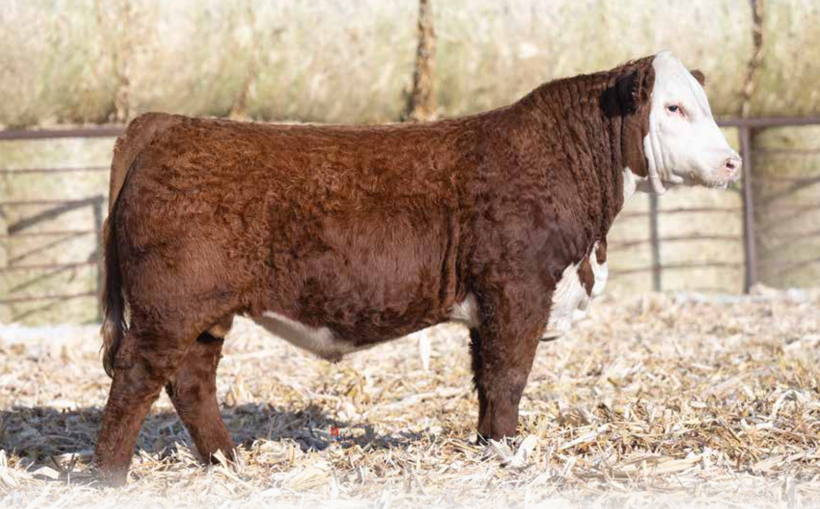
LOT 7 | JDH 1J 376H REDZONE 2M ET