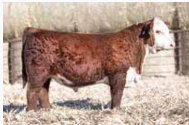
JDH TRAILBRAZER 97J 2L

Maternal brother to Lot 1, sold in our 2024 sale to Double Seven Ranch.