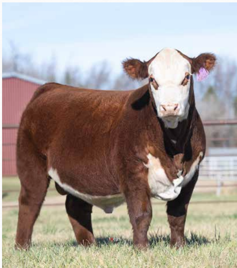
FULL BROTHER TO LOT 39 | JDH AH OLD FASHIONED 25M ET