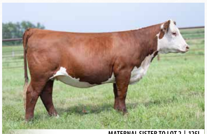
MATERNAL SISTER TO LOT 2 | 125L