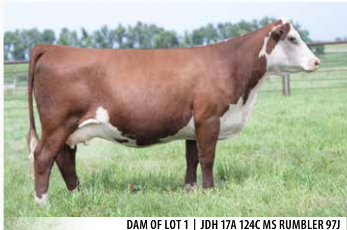
DAM OF LOT 1 | JDH 17A 124C MS RUMBLER 97J

Maternal brother to Lot 1, sold in our 2024 sale to Double Seven Ranch.