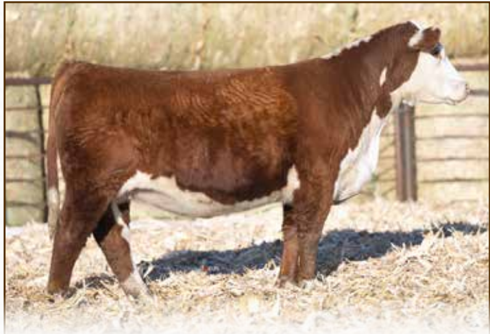
LOT 68 | JDH ND 45H 9365 MS ENTICE 114L

Early udder development looks outstanding on this high performing Entice daughter. Dam has done a great job for us and breeds back on time every year. Carrying a heifer calf out of our new bull from 4B Herefords, Garfield. Calf will be Homozygous Polled by pedigree and is sure to be heavy pigmented. Pasture Exposed to 4B Garfield 338 from 5-19 to 8-1. Vet called safe for a March 14th calving date carrying a heifer calf.