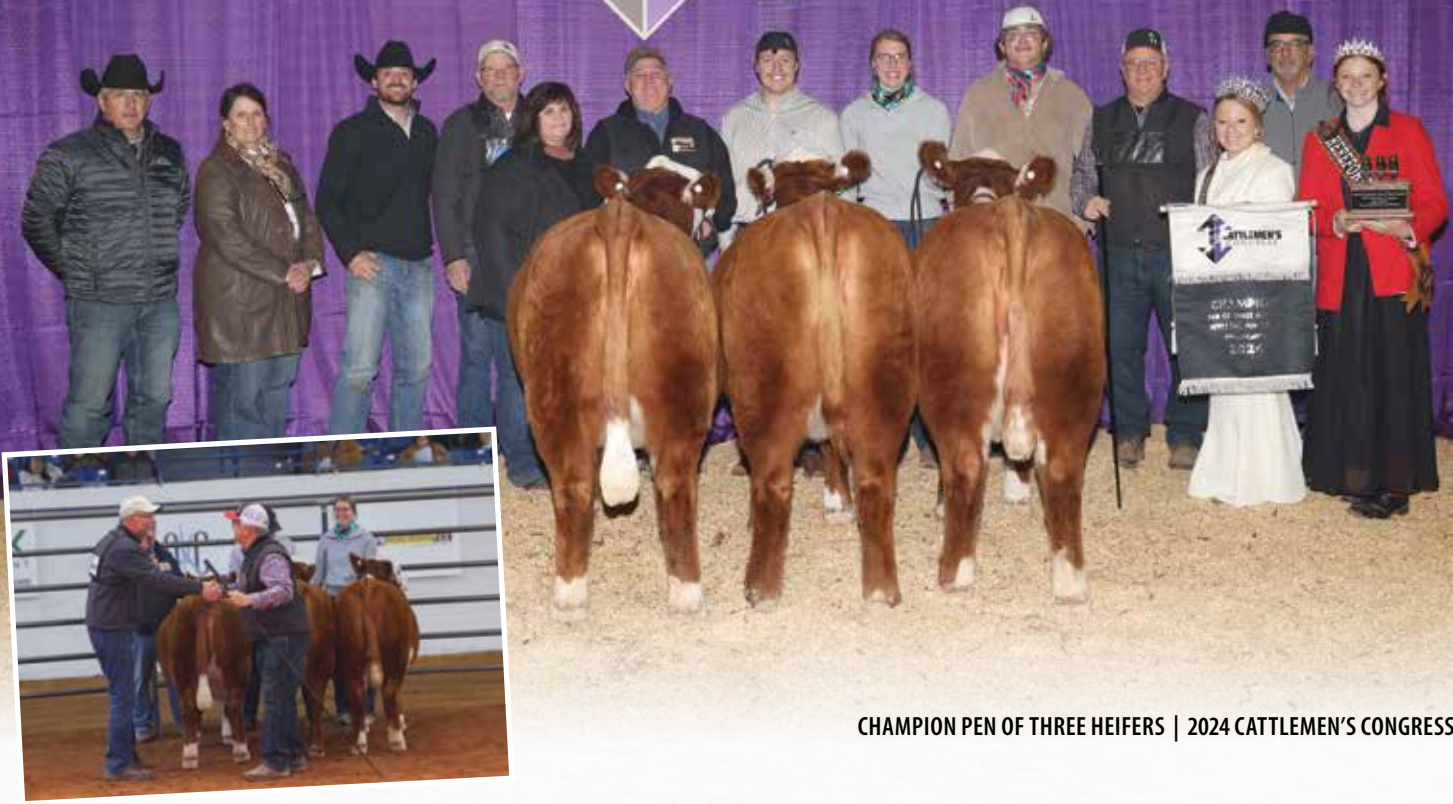
CHAMPION PEN OF THREE HEIFERS | 2024 CATTLEMEN'S CONGRESS