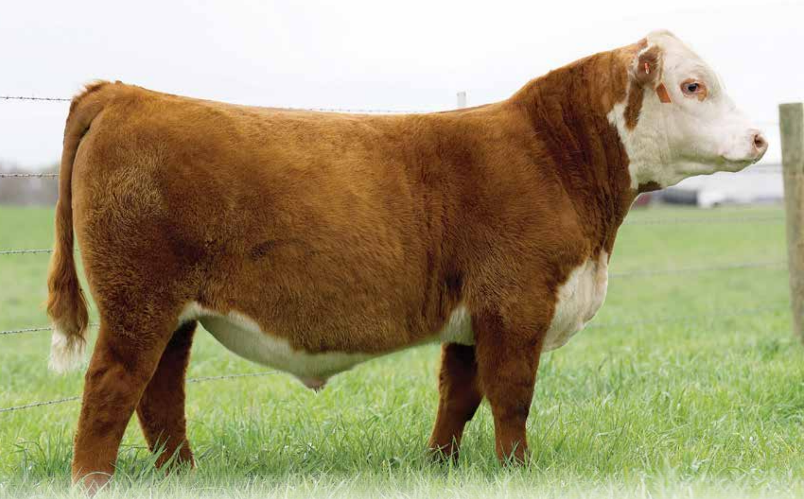
LOT 45 | AH BLAZING PRINT 394L