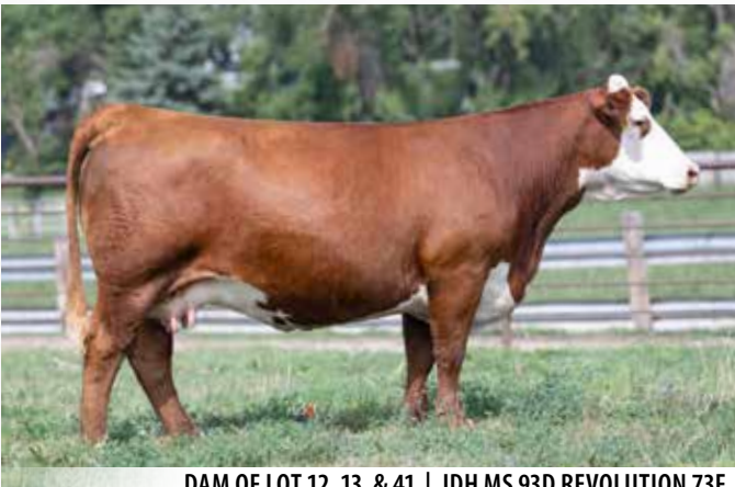
DAM OF LOT 12, 13, & 41 | JDH MS 93D REVOLUTION 73F