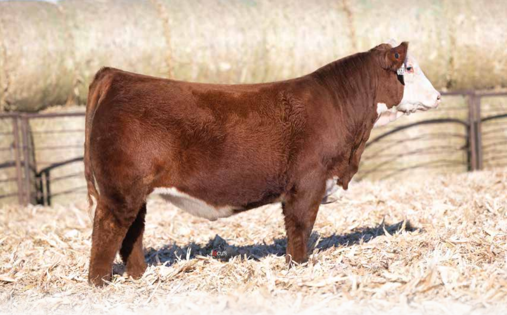
LOT 40 | AH MMC IN DEMAND 4887 ET