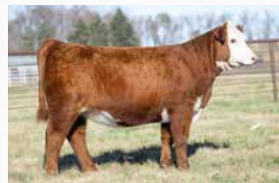
JDH ND 610D LADY ZENA 17M ET

75M is another bull prospect that will sire tremendous females. His pedigree is loaded with generations of fertile, productive cows. A full sister to Lot 28 commanded $8,250 at our state sale.