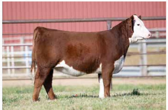
FULL SISTER TO LOT 63 | 4859

AI'ed to RST Final Print 0016 on 4-21-24. Vet called safe to AI date due January 29th. Pasture Exposed to RST 0016 GoldPrint 3031 from 4-25 to 7-1.